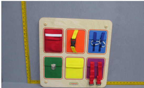
Sample Number 85181660719A1